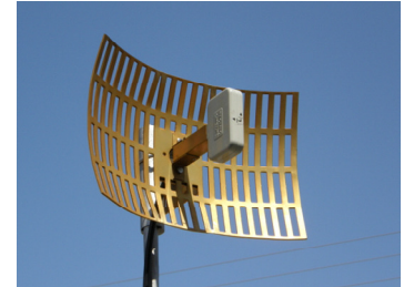
Antenna Mounted Vertically Polarised